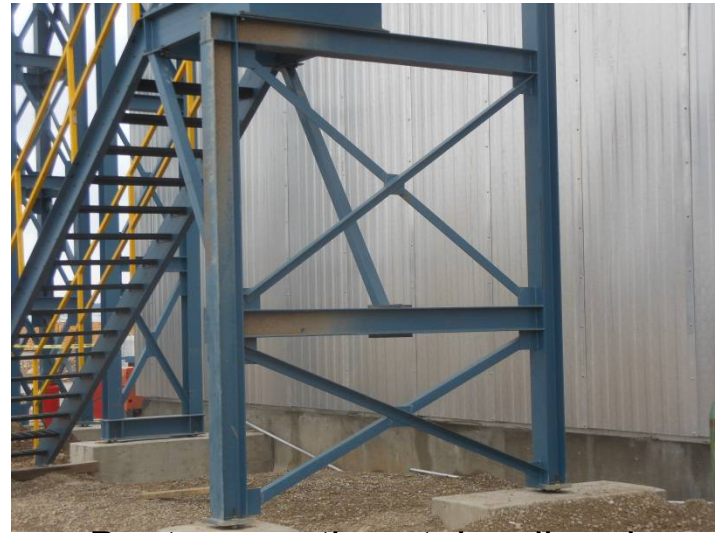
Bent supporting stairwell and walkway