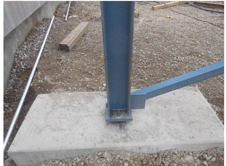
Bent supporting stairwell/anchorage