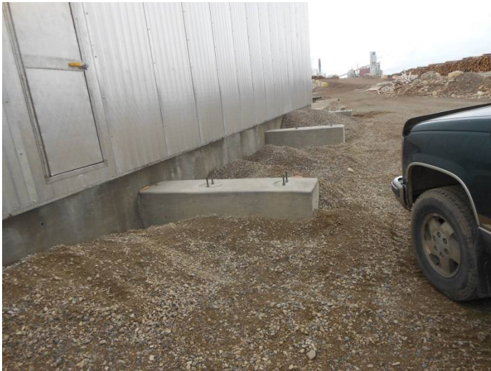
Footings for walkway bents