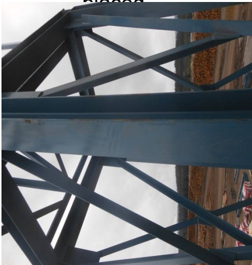
Support tower for walkway