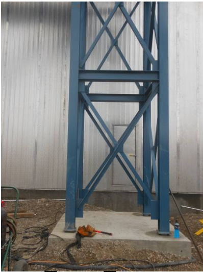
Truss Tower w/footing