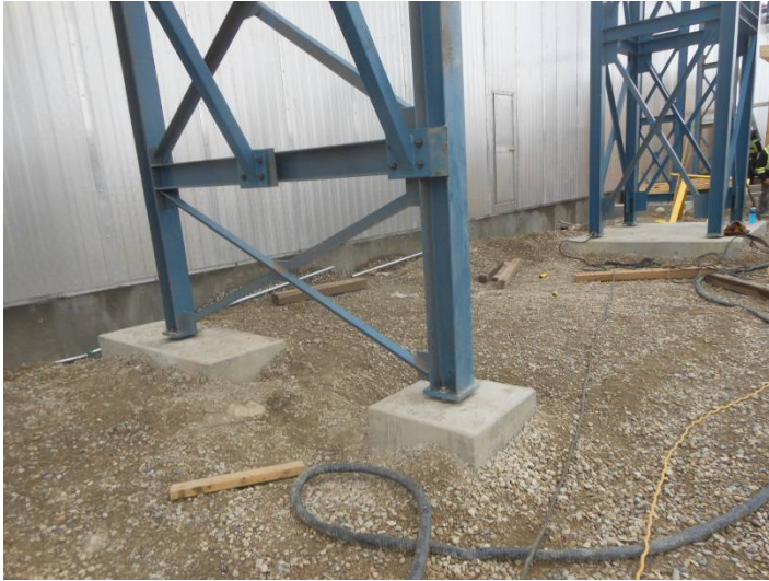
Bent supporting stairwell/footings