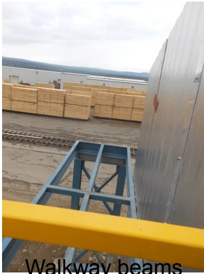
Walkway beams before grating placed