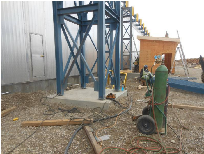
Truss tower and walkway bents in view