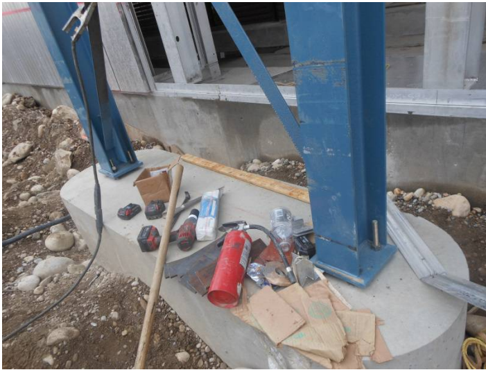
Steel bent for truss w/footing