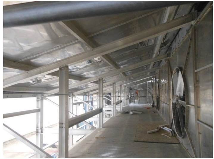
Kiln building-top walkway