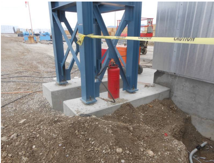
Tower for walkway w/footings