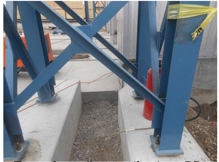
Tower for walkway w/footings PD-04