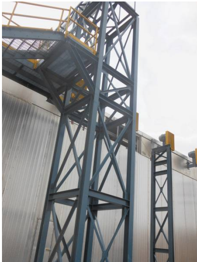
Tower 5'x5' (X-braced)