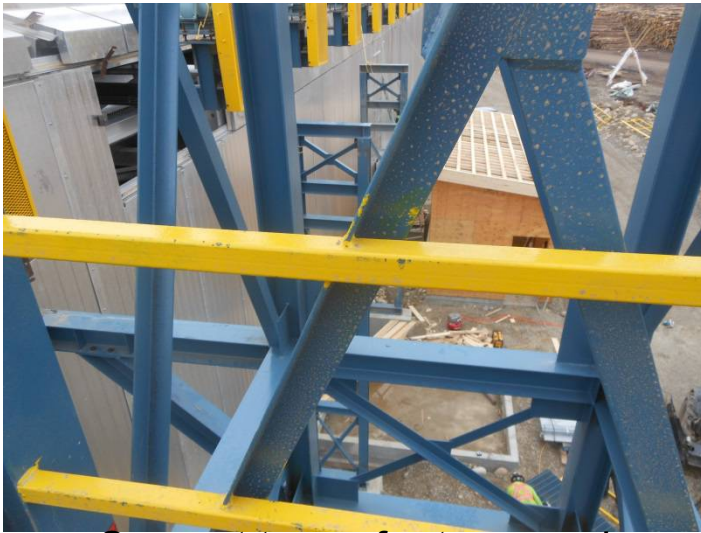
Support tower for truss and walkway