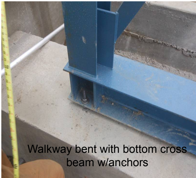
Walkway bent with bottom cross beam w/anchors