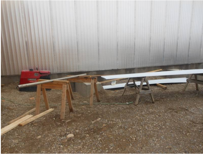
Sideview on kiln building