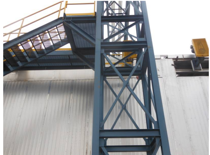
Tower 5'x5' with platform for stairwell