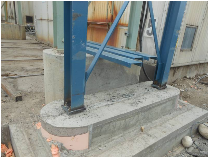
Support Bent under Truss, PD-05