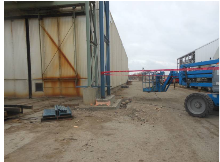
Support Bent under Truss