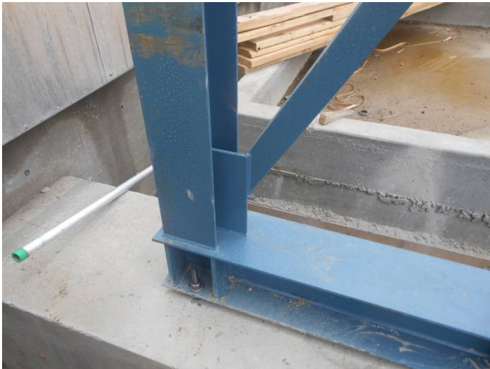
Walkway bent-at the bottom