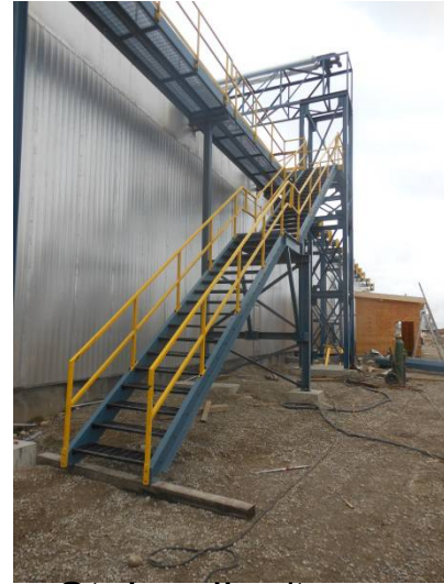
Stairwell w/tower in view