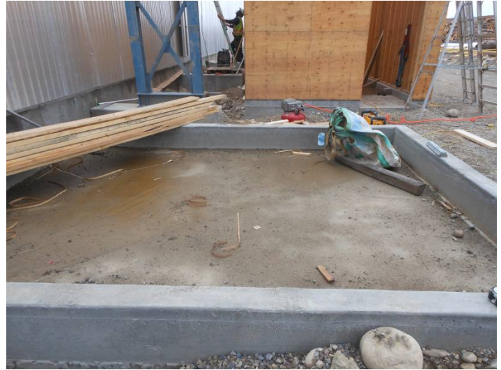
New electrical room-top