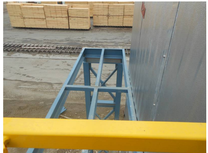
Walkway beams along short side