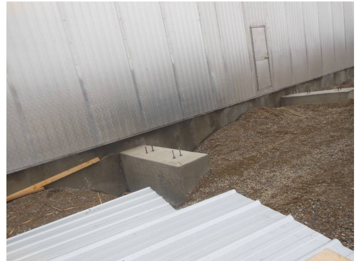
Footing for walkway bent with anchors